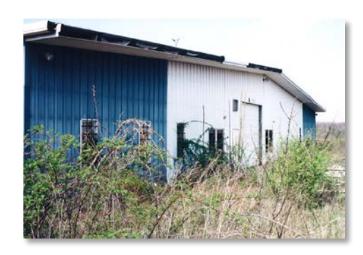
Figure 2. Former Transicoil facility prior to site cleanup.

In 1990, EPA added the site to the Superfund program's National Priorities List (NPL). Investigation results verified that past site activities contaminated area ground water, including nearby