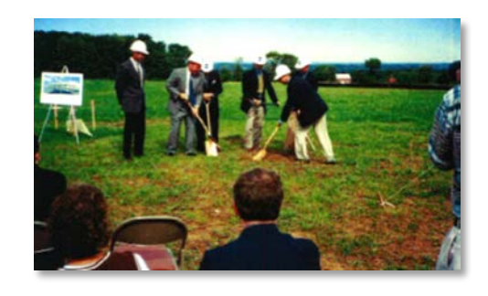
Figure 3. Techni-Tool groundbreaking ceremony in 1999.

With cleanup underway, the site began to attract attention for its reuse potential. T-Squared Realty, a local real estate company, saw the site as an ideal opportunity for industrial development. Techni-Tool, a tool distribution company, saw the area as an