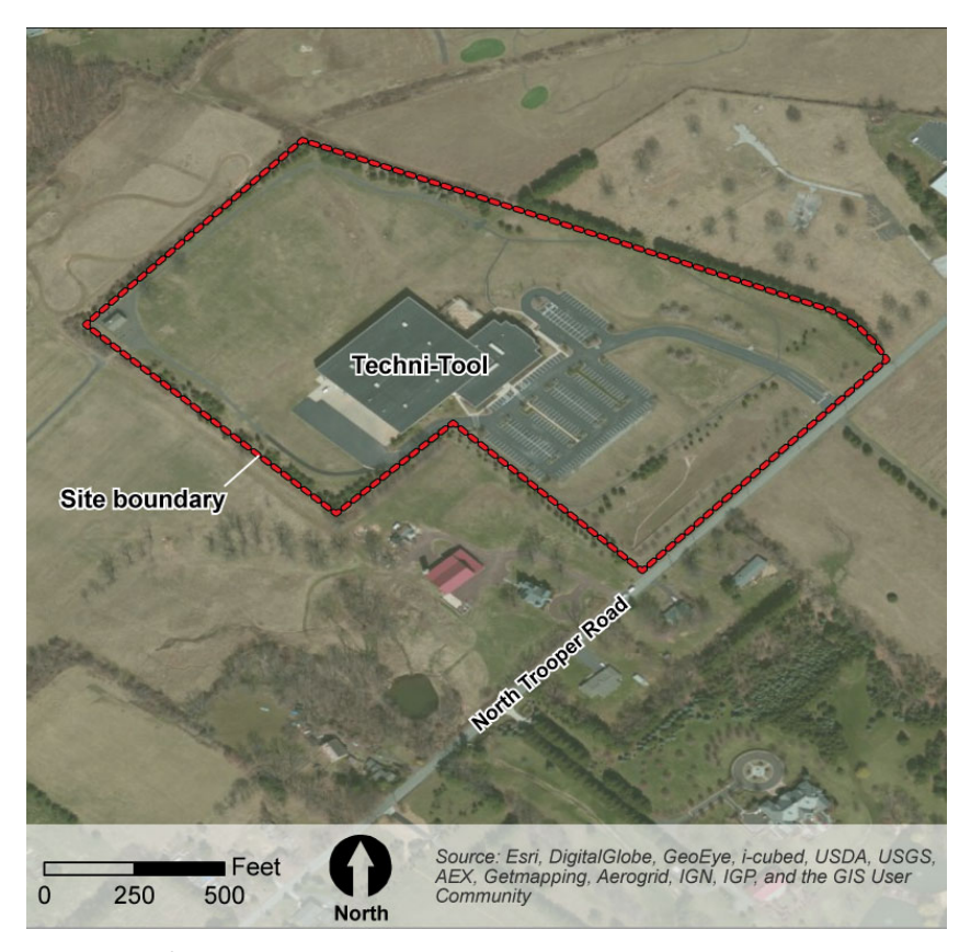
Figure 4. Site layout map.

With this document and a cleanup plan in place, the stage was set for redevelopment. EPA and stakeholder cooperation not only addressed liability concerns, but also enabled Techni-Tool to move forward quickly with its expansion plans. T-Squared Realty purchased the property in 1998. Techni-Tool began leasing the property later that year and broke ground for its new 112,000-square-foot facility in August 1999. Techni-Tool began distribution operations in its new facility in 2000. Cooperation and open communication among EPA, PRPs, the property owner and Techni-Tool meant that facility construction could move forward during installation of the public water supply extensions and construction of the ground water treatment system.