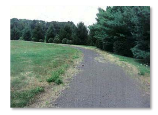
Figure 5. Techni-Tool's employee walking trail on site.

Stakeholders worked together to make sure cleanup would protect public health and the environment. Business and property owners agreed to abide by ground water use restrictions and also worked closely with EPA during cleanup to share information about the process. Techni-Tool also grants site access to PRP contractors to perform necessary monitoring and testing. Finally, this collaboration has resulted in a new recreation amenity for site employees. Techni-Tool put in a ¾-mile walking trail to provide easy access to monitoring wells and help establish a campus-like setting for its employees. PRP contractors use the trail to access monitoring wells and the site's ground water treatment system. Techni-Tool employees use the area for outdoor meetings and exercise.