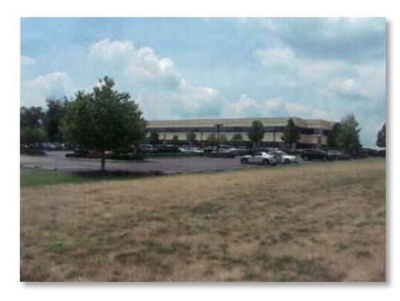
Figure 6. The Techni-Tool facility.

Looking forward, EPA will continue to work with site stakeholders to support protective reuses and ensure the long-term stewardship of site remedies. As Techni-Tool continues to grow, its facility on site will continue to host its expanding workforce.