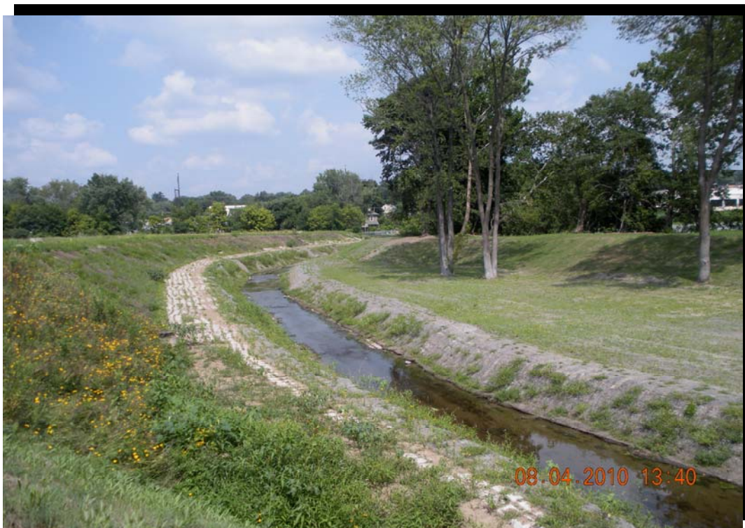
The Completed Restoration of Rose Valley