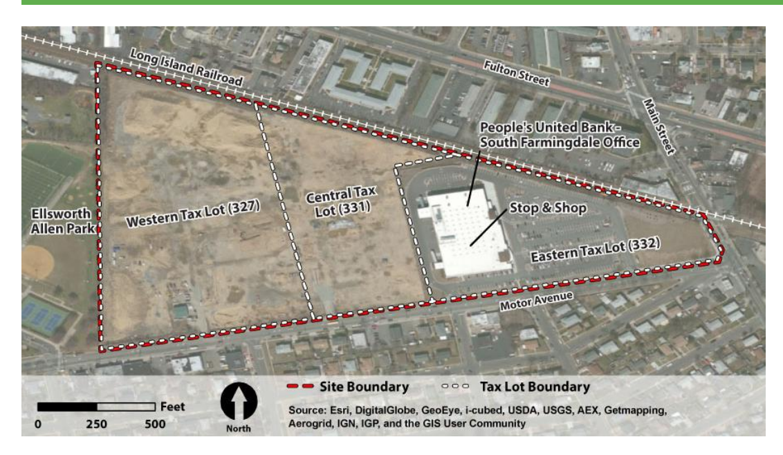
Figure 4. The site consists of three parcels of land, the western, central and eastern parcels.

At a June 2007 meeting, the Town of Oyster Bay informed EPA that it was considering a further 7-acre expansion of Ellsworth Allen Park which would extend across the central tax lot as well. Because cleanup goals for this area had only accounted for commercial and industrial uses, additional site assessment was required. The Town took steps to qualify as a bona fide prospective purchaser (BFPP) to take advantage of the amendment to CERCLA that allows BFPPs to own property at Superfund sites without having CERCLA liability. EPA worked with the Town to assist it in developing the reasonable steps required for BFPP qualification. In July 2010, the locality acquired the central parcel via condemnation. Then, under EPA's oversight in 2011, the Town of Oyster Bay prepared a Risk Assessment Update as well as the necessary remedial enhancement work so they could reuse the central tax lot for recreational purposes. EPA approved the Risk Assessment Update and announced the land use restriction change for the property from commercial and industrial to recreational use.