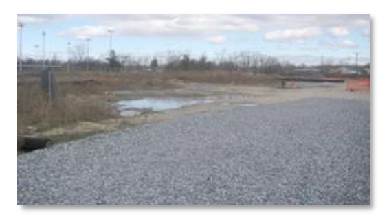
Figure 7. The western parcel next to Ellsworth Allen Park is ready for the park expansion.

In 2014, the privately owned site property generated $633,338 in total real property tax revenues, with an estimated property value for the former Superfund site of $18,001,100. On-site businesses that produce retail sales and services also generate tax revenues through the collection of sales taxes, which support New York State as well as local governments.<sup>3</sup>