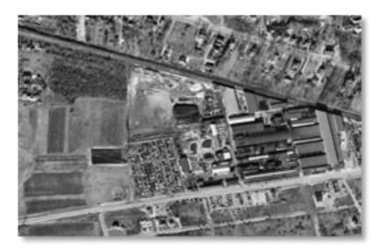
Figure 2. Years of industrial operations left a legacy of contamination at the Liberty Industrial Finishing Superfund site.

Materials used in these operations included volatile organic compounds (VOCs), inorganic compounds, caustics and acids. Untreated industrial wastes were discharged into below-grade sumps, underground leaching chambers and unlined wastewater