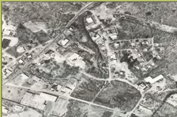
PICTURED: Aerial view of the Nutmeg Valley Road site.

THE BARRIERS: According to business owners, the site's Superfund designation made it difficult to secure loans to maintain and improve properties on