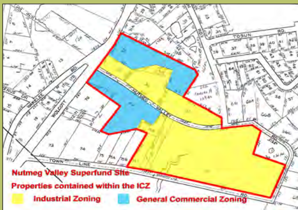
PICTURED: A map of the Nutmeg Valley Road site showing industrial and general commercial zoning.

SOLUTION: Deletion of site from National Priorities List; clear communication about the Site in a site reuse profile.