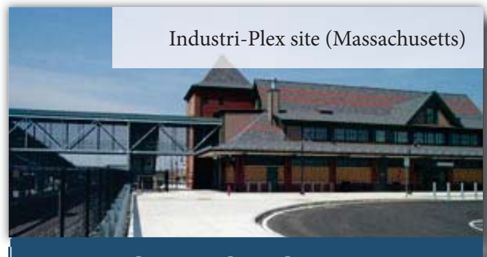
Industri-Plex site (Massachusetts)

EPA has collected property value data for 16 Superfund sites in reuse and continued use in Region 1. These sites span 507