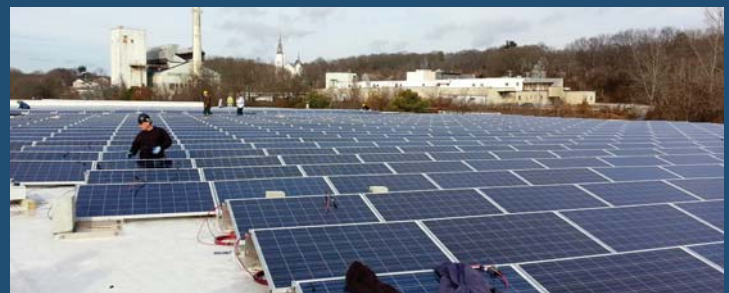
Photo: One (of two) 500 KW solar projects on the roofs of two industrial buildings at the Peterson/Puritan, Inc. site (Rhode Island).

In recent years, there has been a lot of interest in Region 1 in creating renewable energy projects on Superfund and other contaminated sites. Alternative energy projects can have a number of beneficial effects. Across Region 1, a range of efforts have encouraged opportunities for alternative energy project development on current and formerly contaminated lands, landfills and mine sites. Projects in place or under development are supplying electricity to the grid or using alternative energy systems to directly power cleanup equipment or offset grid-supplied power used for site cleanup activities. For example, at the Massachusetts Military Reservation, 4.5 megawatts of wind energy help to power the daily treatment of more than 10 million gallons of contaminated ground water at the base. Through a net metering program with a local utility, the three wind turbines help offset electricity costs and air emissions attributed to ground water cleanup activities by 100 percent. The turbines are expected to result in $1.5 million in annual electricity cost savings for the U.S. Air Force.