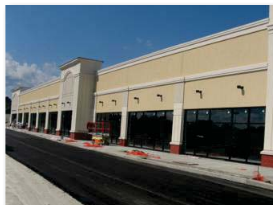
Norwood PCBs site (Massachusetts)

The businesses and organizations located on the sites in reuse and continued use in Region 1 employ over 3,000 people, contributing an estimated $197 million in annual employment income with about $213 million in estimated annual sales. Employee income earned helps inject money into local economies. It also helps generate state revenue through personal state income taxes. In addition to helping local communities by providing employment opportunities, these businesses help local economies through direct purchases of local supplies and services. On-site businesses that produce retail sales and services also generate tax revenues through the collection of sales taxes, which support state and local governments. In addition, most businesses operating on sites in Region 1 generate tax revenues through payment of state corporate income or related taxes. Table 1 provides more detailed information. 2