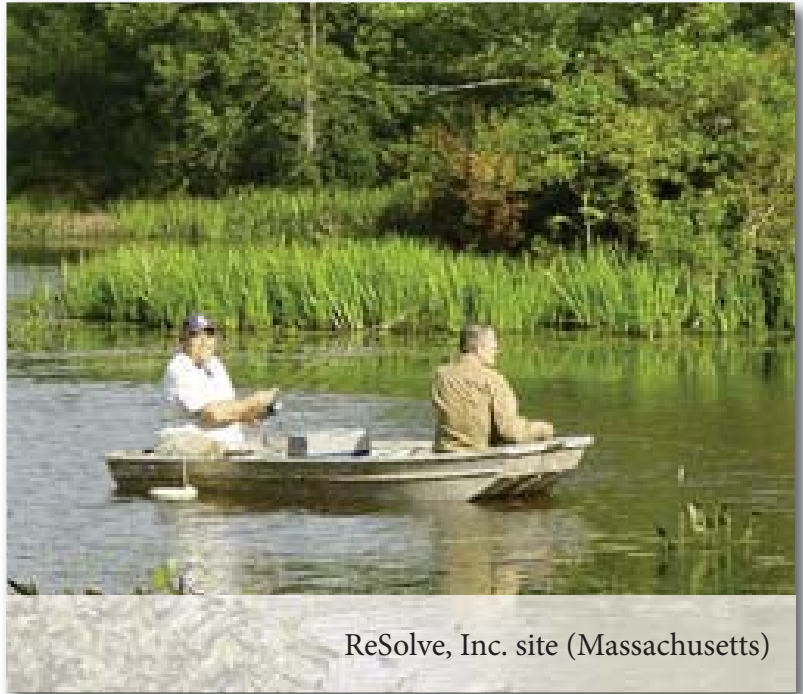
ReSolve, Inc. site (Massachusetts)

Future uses are planned for many more Superfund sites in Region 1, including at least one site in five of the six Region 1 states. EPA continues to support reuse planning and renewable energy assessment for sites in Region 1. EPA welcomes opportunities to work with property owners, developers, municipalities and other stakeholders to find ways to support the restoration and renewal of Superfund sites as long-lasting assets for New England communities.