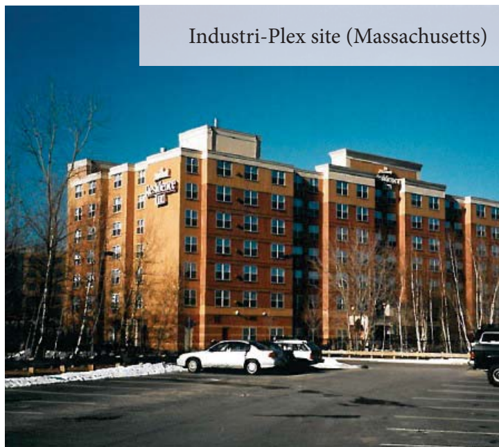
Industri-Plex site (Massachusetts)

This report looks at some of the beneficial effects of reuse and continued use at Superfund sites in Region 1. In particular, it describes some of the beneficial effects of businesses located at current and former Superfund sites, as well as the land values and property taxes associated with Superfund sites returned to use following cleanup.